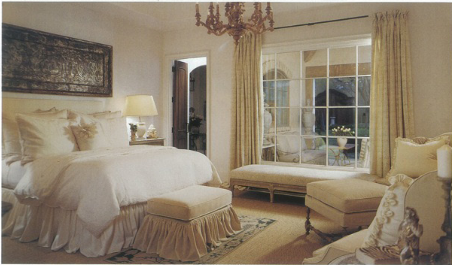
ABOVE: Bed linens in Cowtan & Tout linen and Rogers & Goffigon wool. Bas argenté 17th-c. panel over bed. Nancy Corzine velvet on stool and antique wing chair. French 19th-c. chandelier. Drapes and 18th-c. Gustavian bench in Rose Tarlow-Melrose House linen. Antique Japanese rug on seagrass carpet. BELOW: Antique limestone mantel. Iron 19th-c. garden table. Régence carved overdoor on mirror. Gustavian daybed in Bergamo linen. Curtains in Rogers & Goffigon linen. Waterworks tub and faucets. OPPOSITE: In master sitting area, antique wing chair and custom chair in Nancy Corzine velvet. Pillows in Rogers & Goffigon cashmere. French mirror and limestone mantel, both 19th c. Bookcases adapted from antique pine doors.