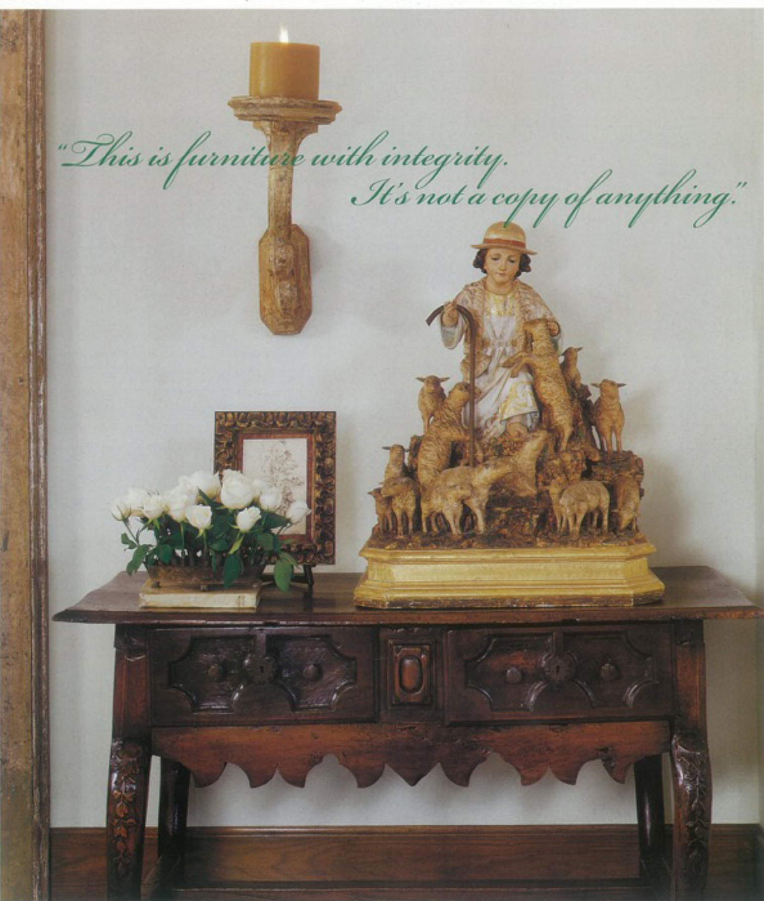
ABOVE: A 19th-c. carving of shepherd on Portuguese table, c. 1720. Italian 17th-c. drawing. OPPOSITE AND FOLLOWING PAGES: Louis XVI trumeaux over French buffet; Swedish side chair in antique linen. Italian 18th-c. lyre table made of old elements. Tuscan 17th-c. chairs in Great Plains wool. Italian 19th-c. bibliothèque with Delft and French faience. Italian painting, c. 1830. Swedish sofa, c. 1740. Florio Collection embroidered linen curtains. Italian 18th-c. wood chandelier. Walnut floor.

"This is furniture with integrity. It's not a copy of anything."