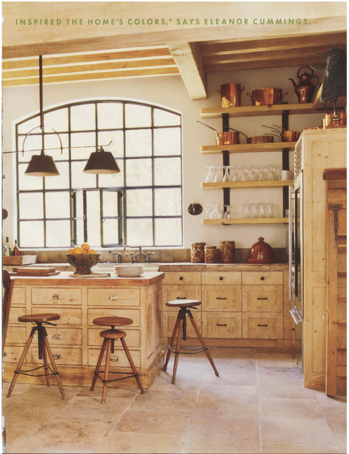
INSPIRED THE HOME'S COLORS," SAYS ELEANOR CUMMINGS.