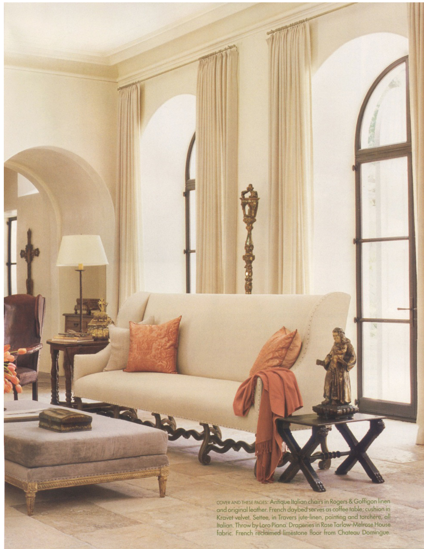
COVER AND THESE PAGES: Antique Italian chairs in Rogers & Goffigon linen and original leather. French daybed serves as coffee table; cushion in Kravet velvet. Settee, in Travers jute-linen, painting and torchère, all Italian. Throw by Loro Piana. Draperies in Rose Tarlow-Melrose House fabric. French reclaimed limestone floor from Chateau Domingue.