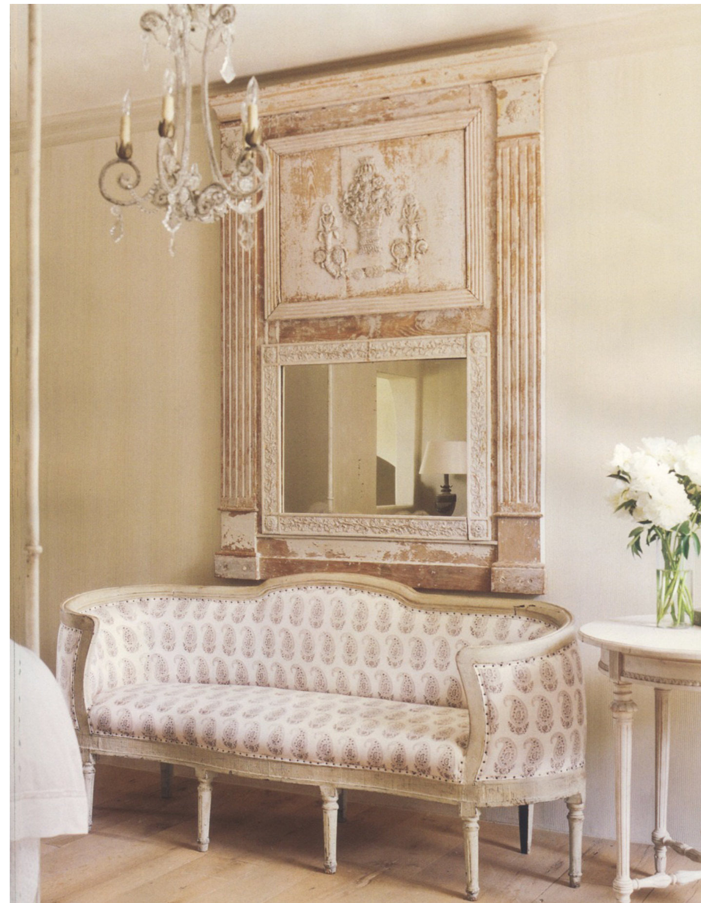
ABOVE LEFT: Antique Italian daybed in Rogers & Goffigon linen; antique tapestry pillow by B. Viz. Antique Provençal screen. Custom sconce. ABOVE RIGHT: In master bath, Roman-style tub, Venetian mirror and French slipper chair, in Rogers & Goffigon linen, all antiques. THG faucetry. Antique Italian angel table. BELOW AND OPPOSITE: In guest room, custom bed's headboard inspired by antique Italian carving. Antique Swedish tables. Draperies, bedskirt and antique Swedish settee, all in Les Indiennes paisley. Sferra linens. Italian lamp. Antique French chandelier and trumeau. Comb-painted walls. Floor of bleached, reclaimed white oak.